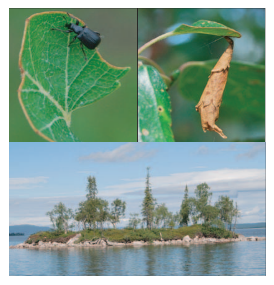
Fig. 1. The birch leaf roller, Deporaus betulae , is the dominant insect herbivore of Betula pubescens on islands in lakes Hornavan and Uddjaure. Female weevils (top left photo) roll conspicuous, conical leaf rolls (top right photo) in which they oviposit. Weevil leaf damage is highest on small, retrogressed islands (bottom photo).

surveying every other leaf until 10 leaves were surveyed. Leaf damage by weevils is characterized by obvious scraping of the top of leaves and is easy to distinguish from other (less common) forms of herbivory. During July and August surveys, we also counted the total number of ants and spiders on each branch after surveying weevils and leaf rolls. Ants and spiders are generalist predators, and we considered them potential predators of weevils after observing avoidance behaviour of these predators by adult weevils (G. Crutsinger, personal observation).