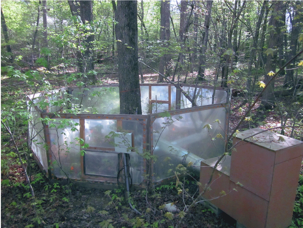
PLATE 1. A single chamber within the experimental climate warming array at Duke Forest, Hillsborough, North Carolina, USA ( \sim 36^\circ ).

each of the ant species present in the pitfall traps at Duke and Harvard Forests were obtained from the primary literature and museum records (Fitzpatrick et al. 2011).